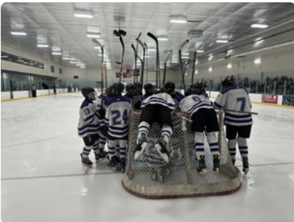
Athletics Hockey shenanigans!