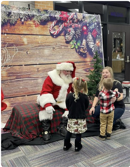
TOTE Early On TOTE Pizza Party with Santa.